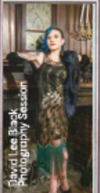
David Lee Back Photography Session