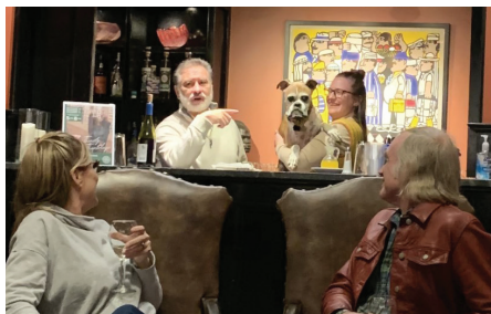
Our Providence Art Club CPO [Chief Petting Officer] gets behind the bar to try her paws at bartending...her mixology skills were 'ruff'. Better luck next time, pup!