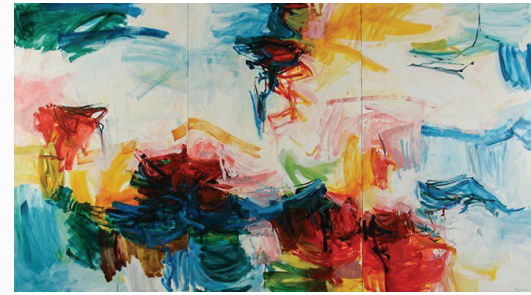
"La Serenata (The Serenade)" by Michael Rich is currently on display in Venice, Italy at the 2022 Venice Biennale.