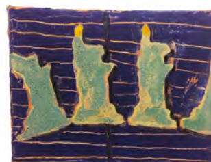
Emma Eichorn, Rhode Island School of Design

Opening Receptions Sunday, October 13, 2 - 4pm