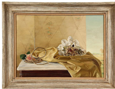
Florence Leif, 1946

Victorian, Chippendale, Queen Ann, and the like, according to today's "tastemakers"—it's all a bit passé. The hottest style in the current collectible market is undoubtedly Mid-century modern.